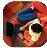
Off Campus Home